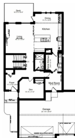
Main Floor Plan