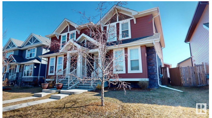
1083 Watt Promenade SW Edmonton

A large, multi-story house with a red and white exterior, featuring a prominent front porch and a stone fireplace. The house is surrounded by a lawn and a sidewalk.