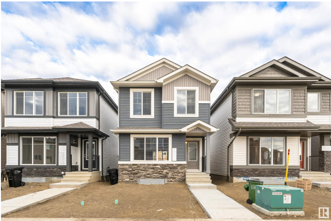
9566 Carson Bnd SW, Edmonton, AB

Main Floor Exterior Area 65.12 m 2 Interior Area 59.37 m 2