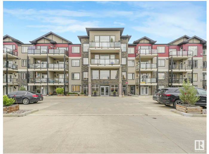
312-12408 15 Ave SW, Edmonton, AB